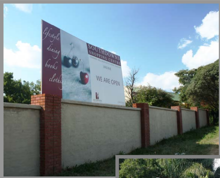
Illegal property development boards erected on sites not associated with the development.