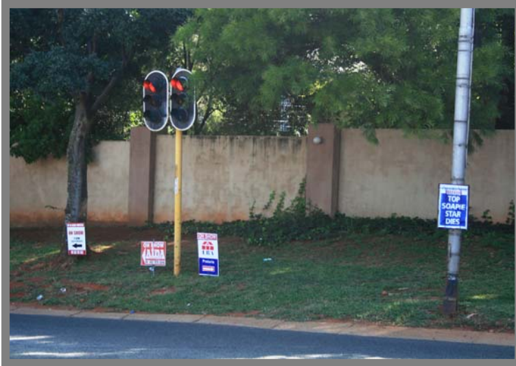
Pointer boards may attract similar boards which may create a proliferation of boards at traffic intersections.