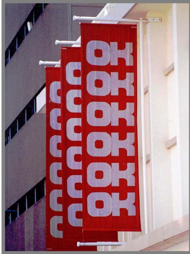
Projecting signs in the form of banners