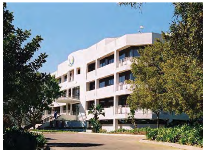
SAWS Headquarters (Bolepi House) in Pretoria.

retain scarce and critical skills in the organisation (with the focus on meteorology, climatology and atmospheric sciences) is having positive results. To date, 124 understudies have been privileged to undergo this programme, whereby critical skills in SAWS are retained by means of a percentage of individuals' salaries. SAWS's strengthened bursary scheme annually awards at least 42 bursaries towards scarce competencies, of which qualified trainees are appointed at SAWS. SAWS has also implemented a career pathing project for scientific and operational staff which promises future success.