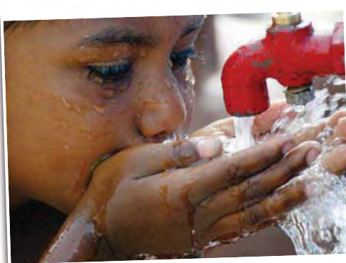
A child drinks water from a tap in a slum area of New Delhi to quench his thirst during a heat wave.