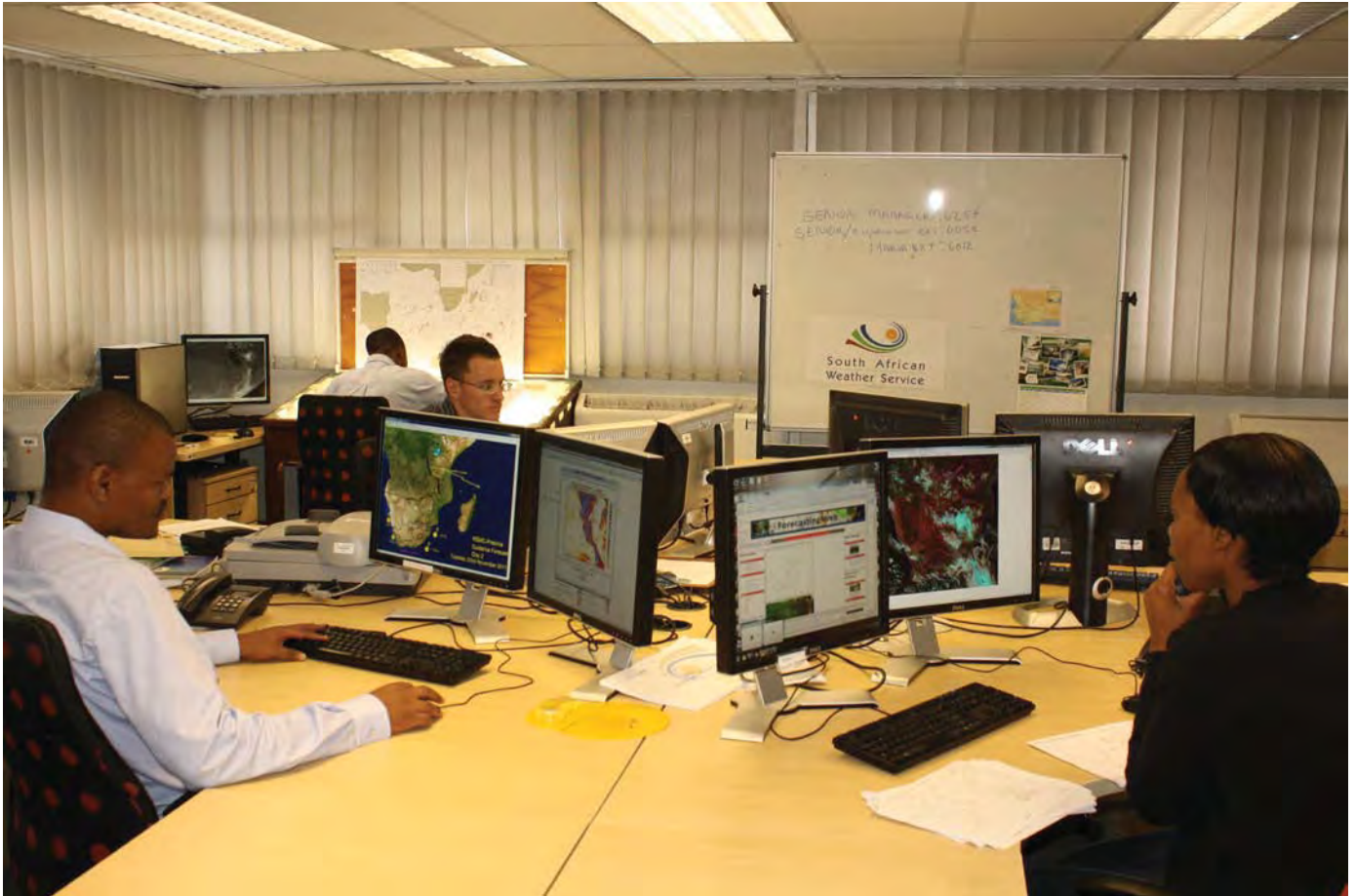
Above: The South African Weather Service forecasters in the National Forecasting Centre in Pretoria.

The South African Weather Service (SAWS) is an ISO9001:2008 certified national provider of weather and climate products and services since October 2011 and is the custodian of the South African climate data-bank. By law, only SAWS may issue severe weather warnings and it therefore cooperates closely with government structures to minimise the impact of weather-related natural disasters towards improving the well-being of all South Africans.