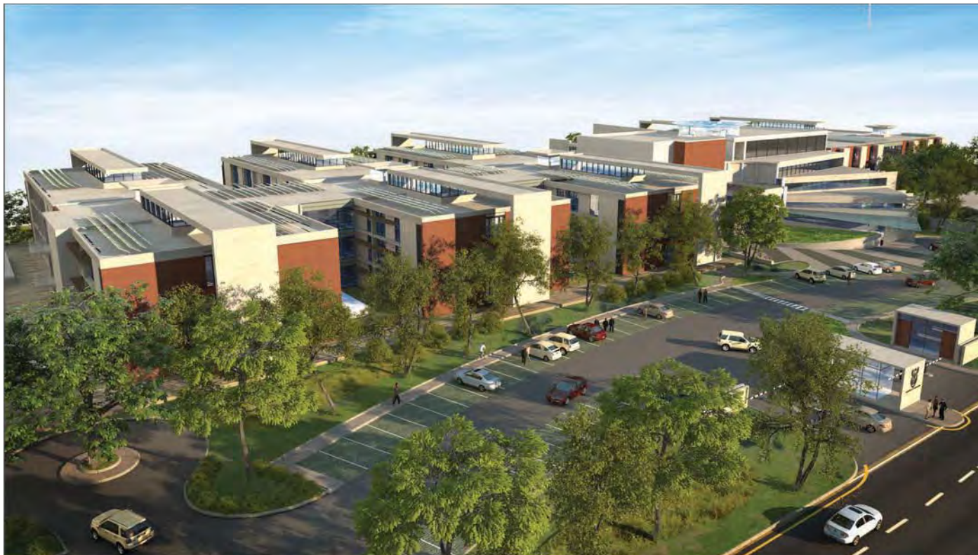
Above: An artist's impression of the green building.

good example for other organisations, of course for the benefit of the environment and future generations," Minister Molewa told the guests at the joyous occasion.