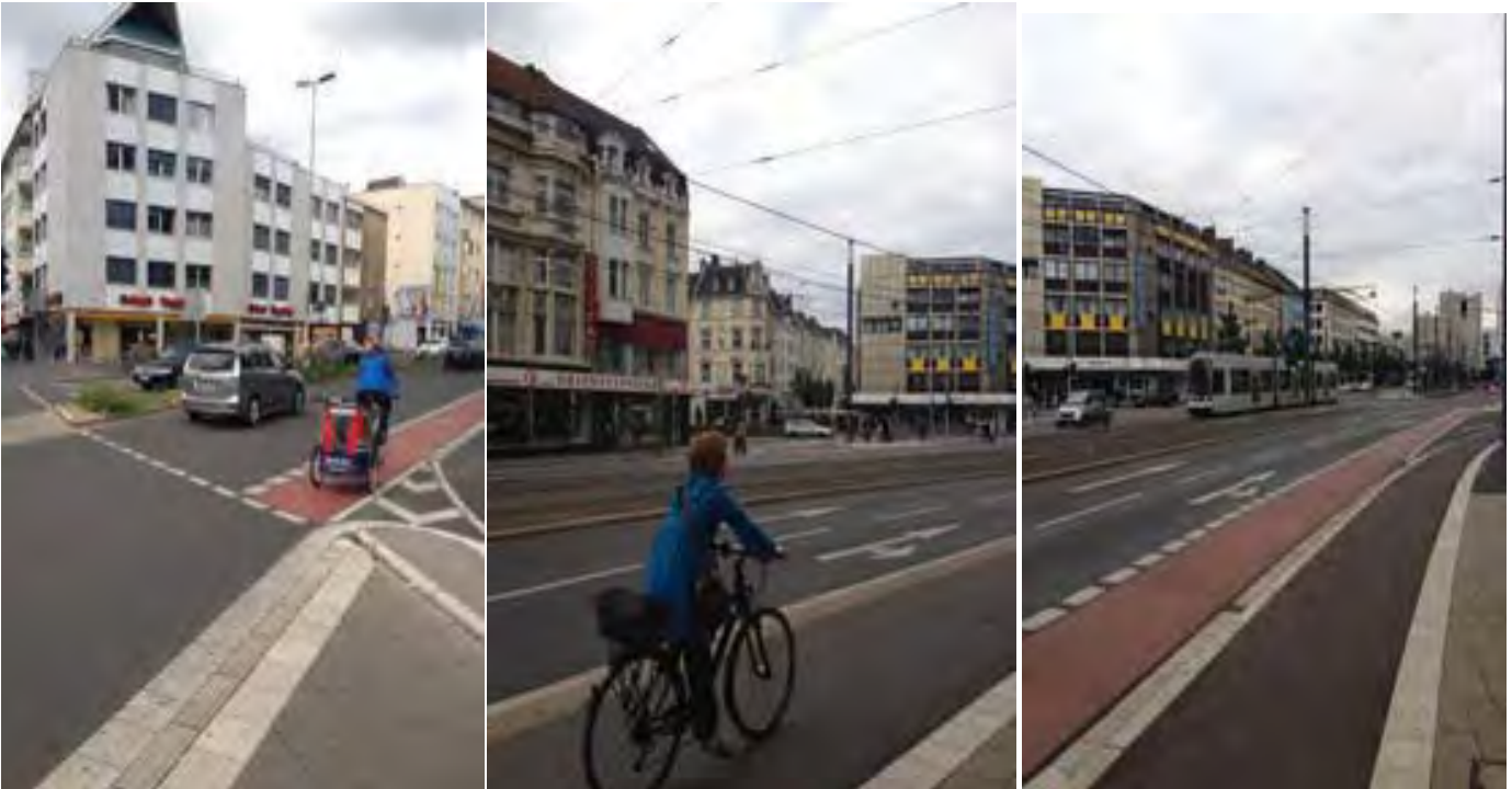
Various simple modes of transport used in Bonn.