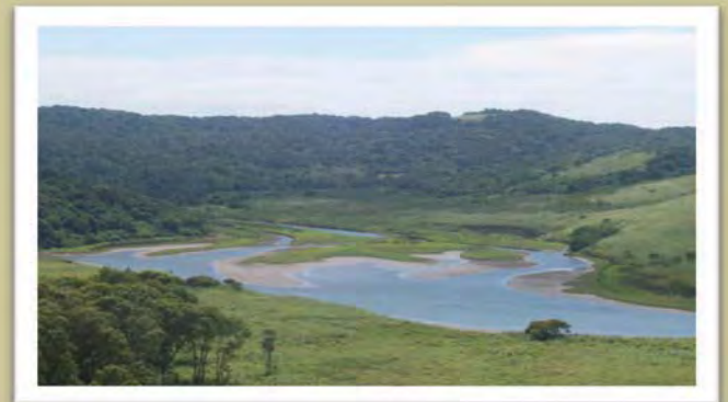
Cwebe Nature Reserve

In opening its case the state indicated that since the written plea explanation by the accused contained admissions to all the elements of the various charges they faced and these had been recorded as formal admissions in terms of Section 220 of Act 51 of 1977, the state did not intend leading further evidence, save for reserving its right to call rebuttal evidence if it deemed it necessary.