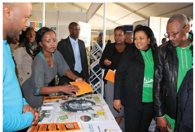
Above: Minister Edna Molewa led the World Environment Day celebrations in Mangaung, Bloemfontein on 5 June, the Minister also visited the exhibition area where information on the green economy was provided.

"We also have the Sustainable Land Based Livelihood whose focus is on projects that encourage restoration, rehabilitation and revegetation of degraded areas. We also assist the municipalities in the management of their open spaces and in most cases this culminates in the establishment of recreational parks. In this regard we are currently involved in the development of a major recreational park in the Batho Township within Mangaung Metro with an approximate value of 35 million Rands," said the Minister.