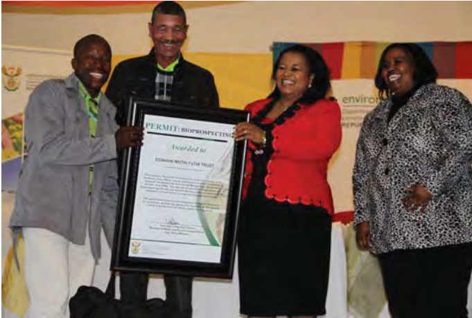
Above: The Edakeni Muthi Futhi Trust received a Bioprospecting Permit for its project of cultivation, processing and marketing herbal products containing active ingredients from Forty (40) indigenous biological resources.

One of the permits was awarded to Rapitrade 670 (PTY) Ltd for the extraction and purification of chemical compounds from the shrublet, Galenia Africana , better known as Kraalbos. "The community of Komaggas would receive both monetary and non-monetary benefits," assured the Minister.