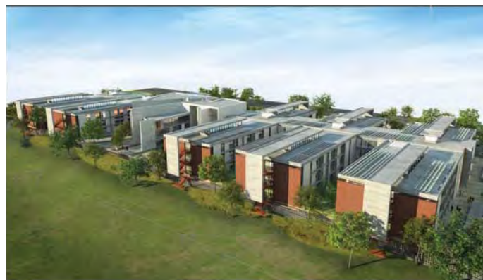
Above: Another view of the new green building.

The signing of the PPP Agreement is pursuant to the