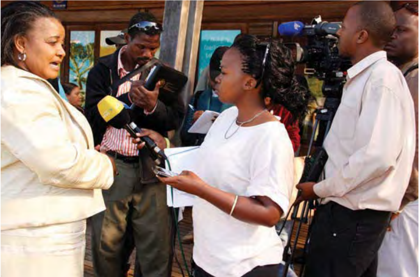
Public plea made: (Above) The Minister of Water and Environmental Affairs, Ms Edna Molewa interviewed by SABC's news reporter during the International Day for Biodiversity celebration at iSimangaliso Wetland Park, in KwaZulu-Natal.

"We need to step up our efforts to protect our biodiversity to allow it to support South Africans – present and future generations included," said the Minister of Water and Environmental Affairs Ms Edna Molewa at the launch of the National Biodiversity Assessment 2011 report. The launch was part of the International Day for Biodiversity celebration held on 22 May 2012 at iSimangaliso Wetland Park in KwaZulu - Natal.