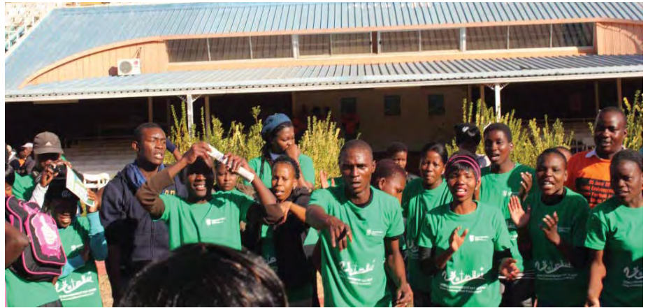
Above: Environmenta Day celebrations in full swing with youngsters at Odi Stadium in Mabopane.

SANBI's application to the jobs fund title Catalysing Access to Employment and Job - Creation in Ecosystem management, was approved by the Development Bank of Southern Africa for R300 million.