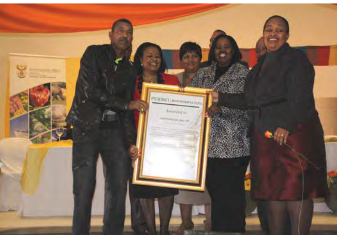
Above: The Edakeni Muthi Futhi Trust and the Minister of Water and Environmental Affairs Ms. Edna Molewa posing for a picture with the Bioprospecting Permit.

The Kraalbos plant grows mostly in large quantities in Komaggas, and it can survive for years before it is replanted." This plant is not only an indicator of disturbance, but is also a pioneer plant, being the first