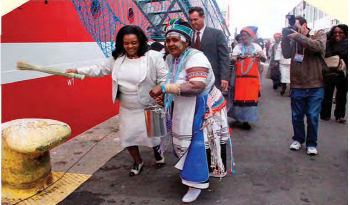
Above: The Minister of Water and Environmental Affairs, Ms Edna Molewa, and a Xhosa traditional healer sprinkle the SA Agulhas II with ubulawu (a Xhosa traditional concoction), before its official sail off.