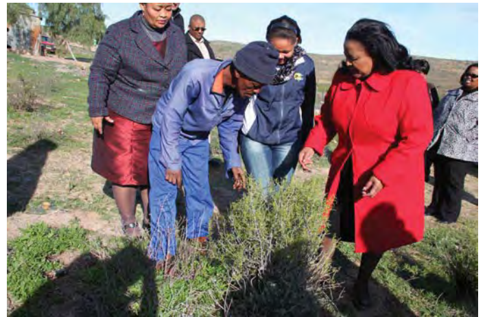
Above: A Kraalbos farmer in Komaggas and the Minister of Water and Environmental Affairs, Ms Edna Molewa looking at the Kraalbos.

"We must build a shared appreciation of the importance of medicinal plants resources to human health and well-being and a shared concern about the conservation and sustainable use of these resources," she said.