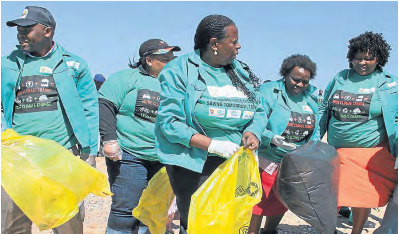
Above: Deputy Minister Rejoice Mabudafhasi in a coastal clean up campaign in 16 September 2011 co-hosted by Umdoni Municipality.

Human activities generate many by products which are seen as useless and are discarded as waste.