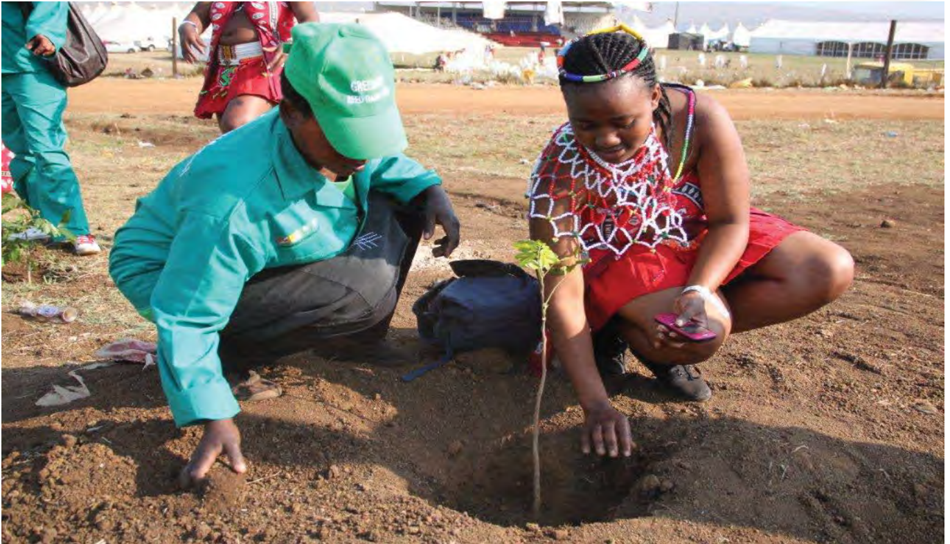
Above: The DEA official and a maiden planting a tree during the Reed Dance in Kwa-Zulu Natal at Kwanongoma.

chaired by the department. The primary objective of the Green Fund is to provide catalytic finance for high quality, high impact green economy projects and mainstreaming activities which would not have been implemented without fiscal support.