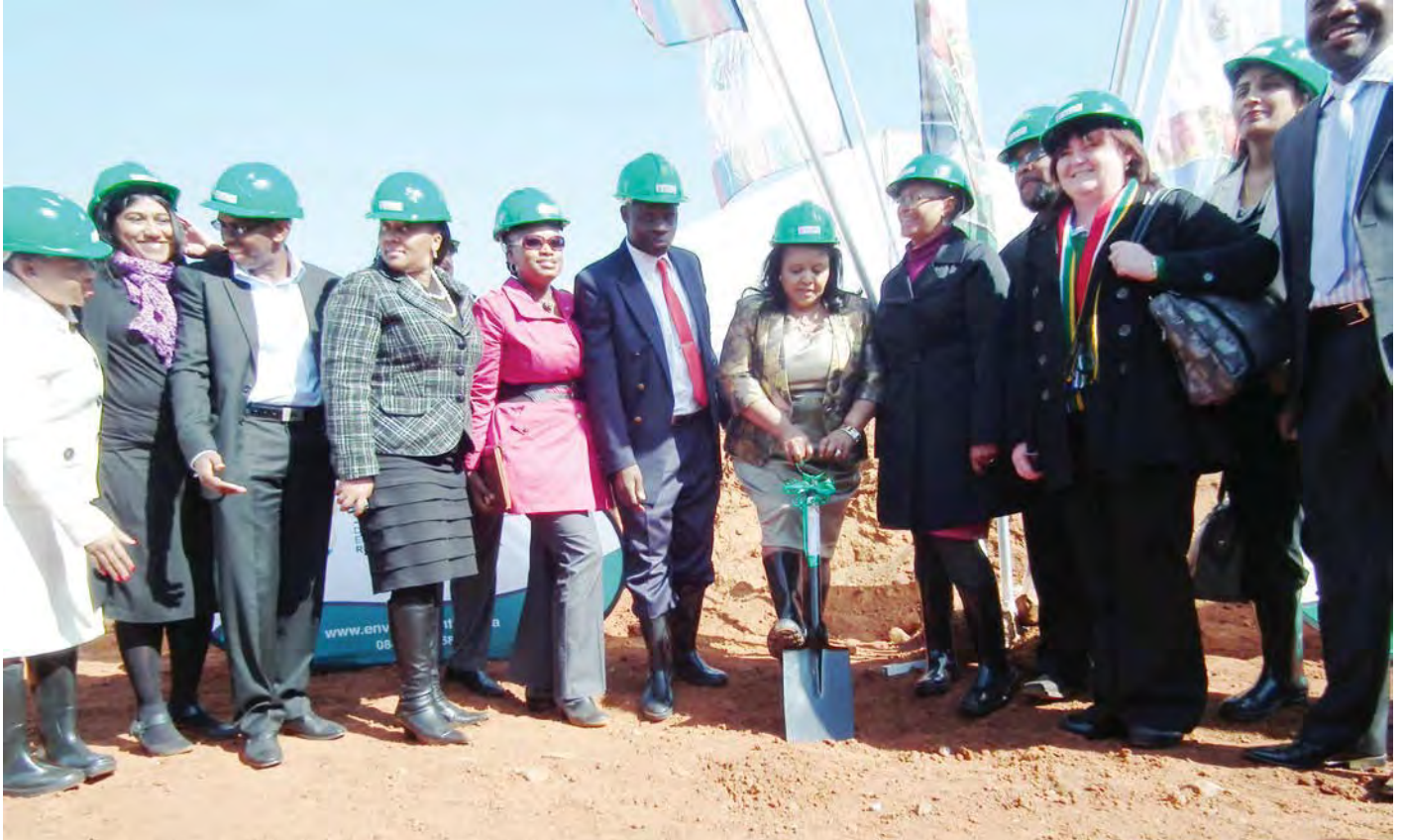
Above: Minister of Water and Environmental Affairs Edna Molewa ( centre ) surrounded by the department's senior managers at the sod turning ceremony.