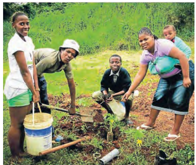
Above: A family gets involved with establishing their food garden and planting fruit trees.

People are realising significant energy, water and time savings, and enjoy improved convenience and aesthetics. Water and food security have been boosted. Fresh, nutritious food grows at their doorstep and the local area has been upgraded. Training and work opportunities were created and the avoided carbon emissions are being sold to generate some revenue for the community.