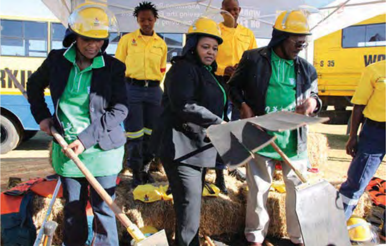
Above: The Free State MEC for Economic Development, Tourism and Environmental Affairs, Ms Mamiki Qabathe, the Minister of Water and Environmental Affairs, Ms Edna Molewa, and the Deputy Executive Mayor of Mangaung Metropolitan Municipality, Cllr Mxolisi Siyonzana.