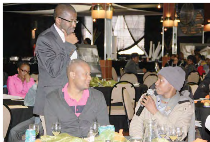
Above: DEA staff were given the opportunity to pose questions on the new green building.