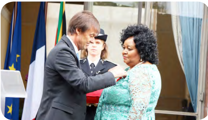
Above: Minister Molewa was bestowed the award of Officier de l'Ordre National de la Légion d'Honneur by the French Minister for the Ecological and Inclusive Transition, Mr Nicolas Hulot.