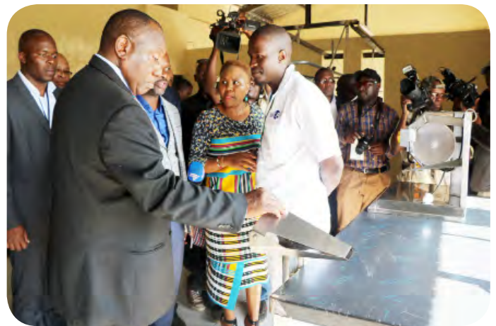
Above: President Ramaphosa and Minister Zulu doing a walk about in the Matsila Chicken Abattoir.

President Cyril Ramaphosa visited Ha-Matsila Village in Limpopo to launch the Ha-Matsila Development Trust Project.