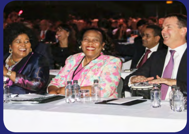
Above: Environmental Affairs Minister, Mrs Edna Molewa, Deputy Minister Barbara Thomson, and Mr John E. Scanlon enjoying the drum beating during the CITES COP17 opening ceremony.

South Africa hosted the CITES CoP17 at the Sandton Convention Centre, where CITES Parties and observers engaged in the robust discussions that led to resolutions that will take forward the work already underway around the trade in flora and fauna.