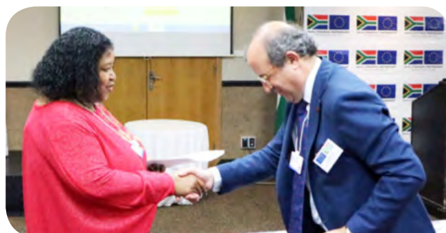
Above: Minister of Environmental Affairs, Mrs Edna Molewa and the European Union's Environment Director- General Mr Daniel Calleja at the Circular Economy Seminar on 4 May 2017 in Durban.

M inister Molewa believes that the country's economic plan such as the tyre industry could serve as an important case study of how Circular Economy can successfully turn waste into wealth. "The South African government has already identified a host of sectors where wealth could be extracted from the so-called dead capital of waste products. One of these is the recycling of tyre and plastics sector. We as the South African government are working hard to amend the Waste legislation to allow for independent operators to run clean-up and processing operations in the different waste management sectors," said Minister Molewa.