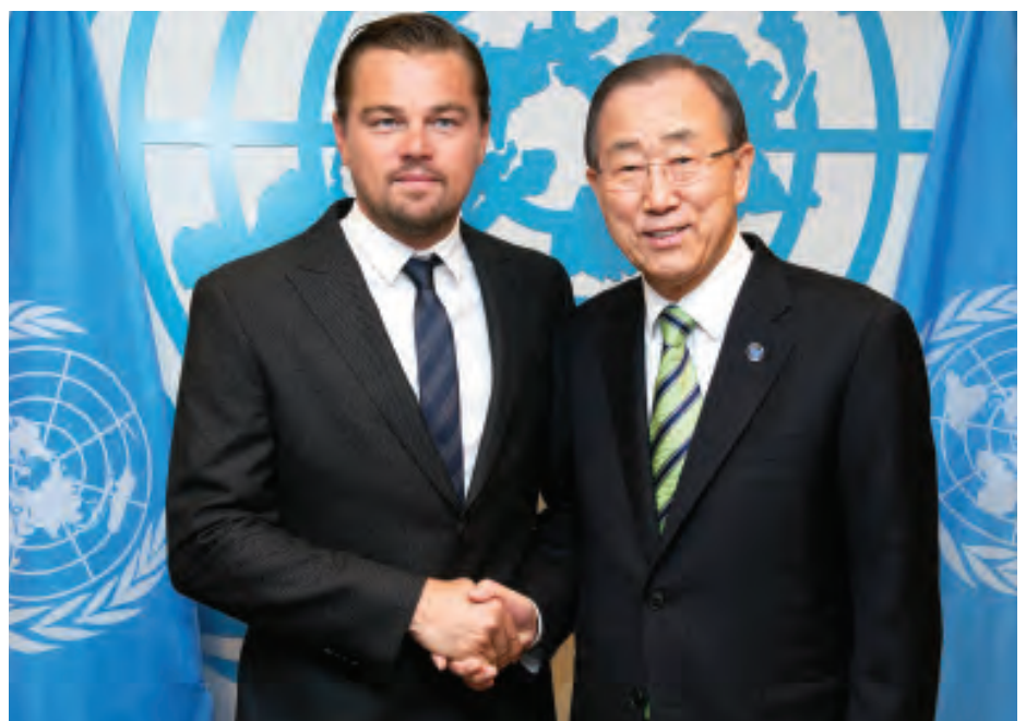
Above: United Nations Secretary-General Ban Ki-moon has designated Academy Award-nominated actor and committed environmental activist, Leonardo DiCaprio, as a UN Messenger of Peace.

The Agreement's main objective is to limit the global temperature increase to well below 2 degrees