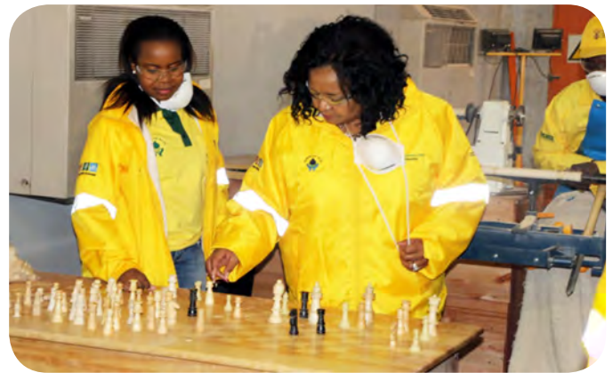
Above: Minister Edna Molewa and Ms Boitumelo Rampeng plays chess on an eco-table.

Minister Molewa intensified the department's stance to create more jobs for the youth of our country through the Expanded Public Works Programme (EPWP). The Minister visited the Eco-Furniture Factory in Garankuwa on 26 June 2015 and spoke to the workers there about the number of job opportunities the department will create.