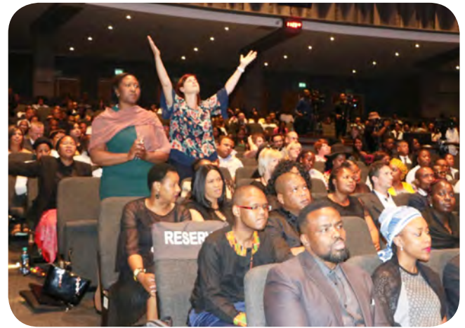
Above: Multitudes of DEA staff came in their numbers to remember and reflect on the life they shared with the late Environmental Affairs Minister Dr Edna Molewa.

D EA staff gathered to remember and reflect on the life they shared with the late Environmental Affairs Minister Dr Edna Molewa.