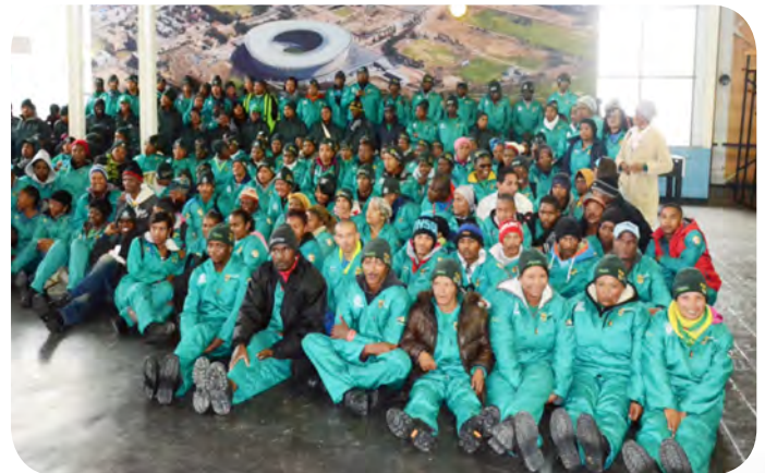
Above: EPWP Beneficiaries pose for picture prior to the clean-up operation in Khayelitsha .

Programmes branches, made donations in the form of educational toys, books, clothing and toiletries to the Lukhanyo Edu-care Pre-school in Khayelitsha. The day ended with a cleaner looking community and delighted children who could not wait open their gifts.