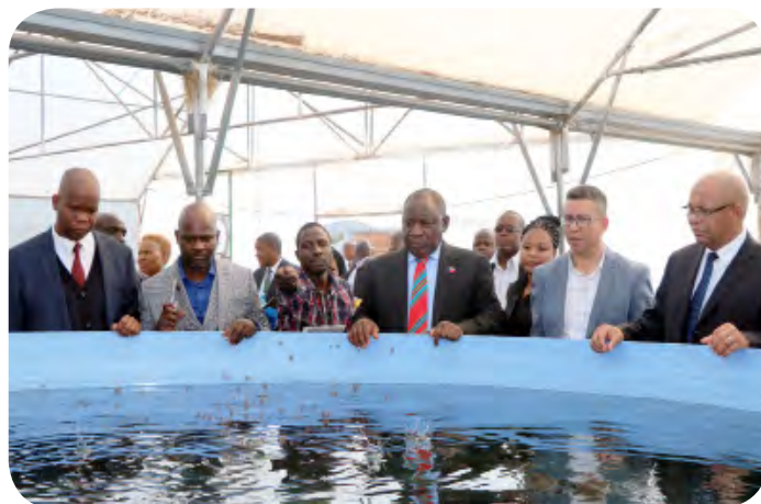
Above: Ministers from different Departments joined hands to fund and support the Matsila Community Development Projects at Ha-Matsila, Limpopo.