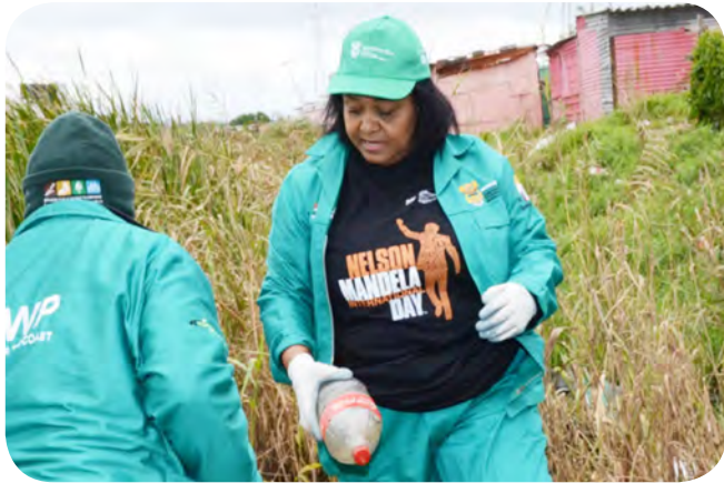
Above: DEA Minister Edna Molewa cleaning the streets of Khayelitsha.