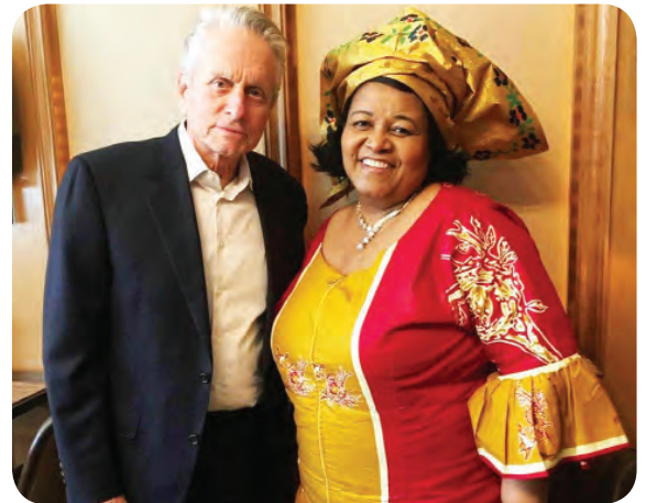
Above: Minister Molewa signs the Paris Agreement on climate change at the United Nations headquarters in New York. On the sidelines of this high signature ceremony, Minister Molewa takes a photo with accomplished actor and UN Messenger of Peace Mr Michael Douglas.

H istory was made when South Africa became one of 172 countries to sign the Paris Agreement on climate change, as this was the highest number of parties to sign such an agreement in one day. Minister of Environmental Affairs, Edna Molewa, signed the Paris Agreement on behalf of South Africa at the UN headquarters in New York.