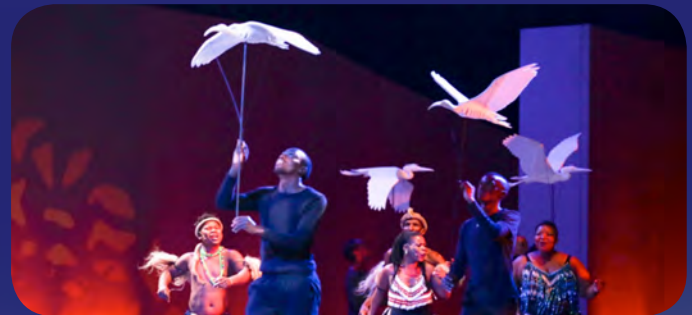
Above: Poets and music artists provided entertainment during the opening of CITES COP17.