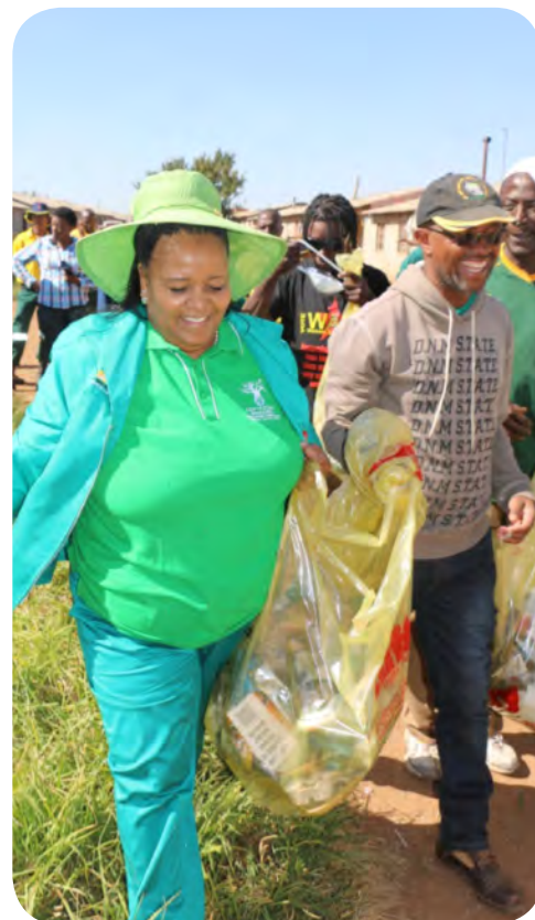
Above: Minister Molewa during the clean-up of Madela Hostel in Randfontein.

She served with conviction and ensured that the environmental sector responds to Presidential THUMA-MINA Initiative. The Thuma Mina Green Deeds Programme and Campaign remains her contribution to the mobilisation of every inhabitant of South Africa to become environmentally conscious. She wanted to see a South Africa free of litter and illegal dumping. She led to change attitudes and behaviour towards waste - and enable people to take responsibility for keeping their communities clean.