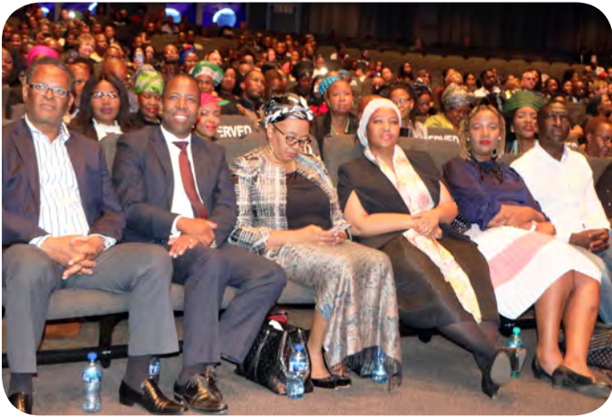
Above: Family members at the memorial service.