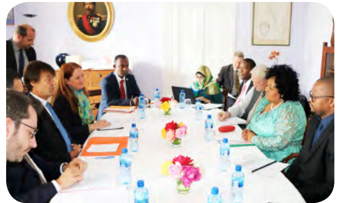
Above: The two Ministers with their officials first sat down for a bilateral meeting before the festivities began.

There was double celebration at the French Residence as the Minister of Environmental Affairs, Dr Edna Molewa was bestowed the award of Officier de l'Ordre National de la Légion d'Honneur (or Officer in the French Legion of Honour) by the government of France. The French were also celebrating Bastille Day which marks the beginning of the French Revolution with the storming of the ancient royal fortress on the day in 1789.