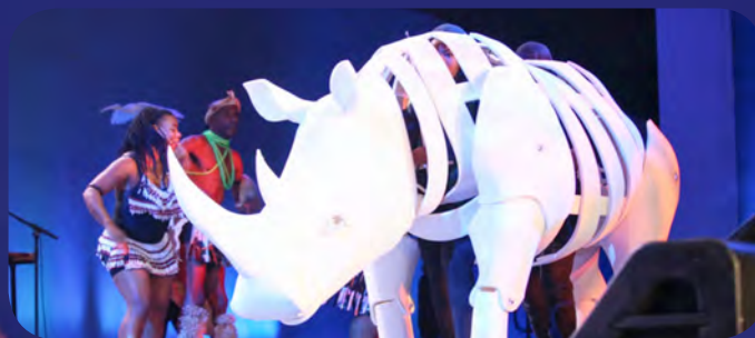
Above: Performance during the opening ceremony.

The CITES CoP17 was the fourth meeting of the Conference of the Parties to CITES held on the African continent since CITES came into force on 1 July 1975, but the first on the continent since 2000.