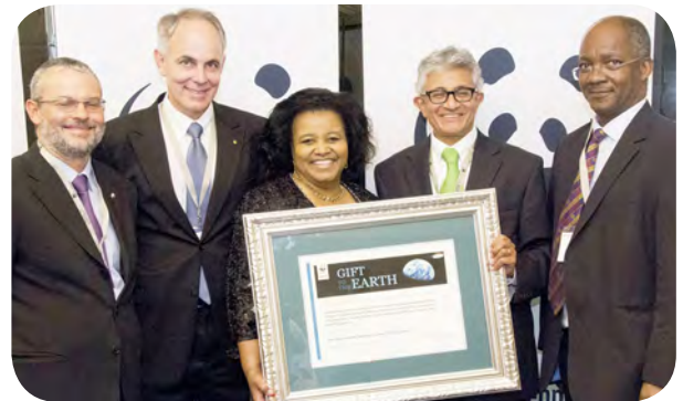
Above: Minister of Water and Environmental Affairs, Dr Edna Molewa receiving the Gift to the Earth Award in Cape Town.

The Gift to the Earth Award is WWF SA's highest accolade for conservation work of outstanding global merit. Minister Molewa received the accolade on behalf of the South African government, following the recent proclamation of the Prince Edward Islands as a Marine Protected Area (MPA) which is South Africa's first offshore MPA.