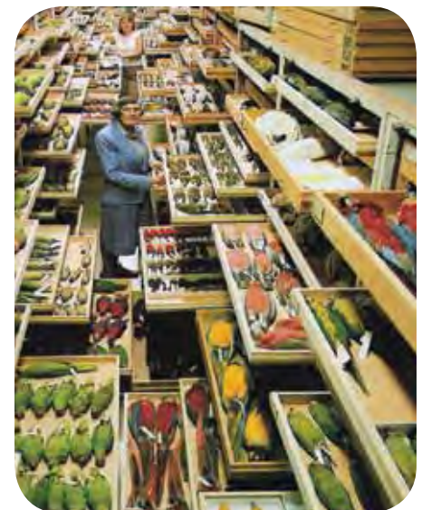
The National Museum of Natural History has over 60 000 bird specimens representing more than 80% of the world's known species.

in investigations, prosecutions and convictions by November 2014 and to construct a reference barcode library containing 2000 priority endangered species and 8 000 closely related or look-alike species to support partner countries. South Africa has selected 200 priority endangered species for the early stages of the project - half plants and half animals.