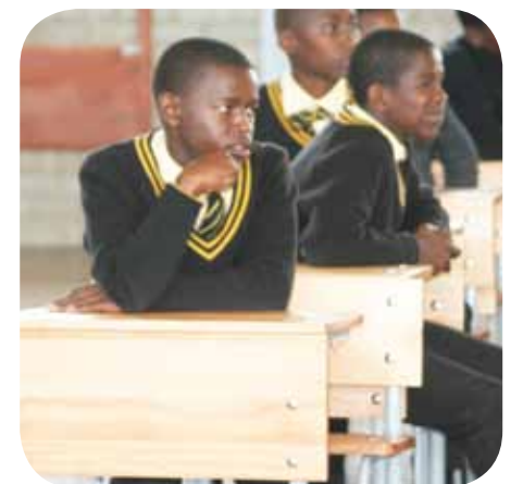
The school desks handed over to Nombulelo High School.

Much remains to be done towards increasing public awareness on the issue of invasive alien plants, promoting voluntary pro-active responses and community ownership of initiatives aimed at the management and containment of invasive alien plants (IAPs). WeedBuster Week is aimed at supporting these objectives.