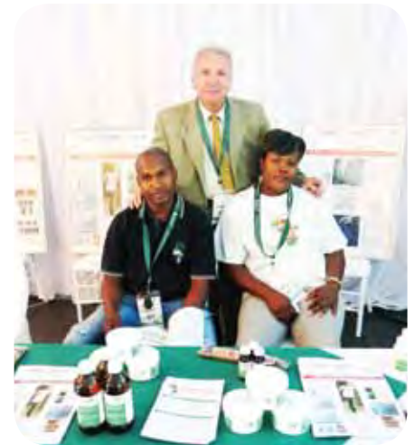
The Syringa Institute on medicine, one of the permit holders exhibit medicines produced from invasive alien plants.

During Mr Sekoati's delivery he highlighted that the sustainable use of indigenous biological resources is fundamental to the development of South Africa's economy. The bioprospecting, wildlife ranching and the hunting industries in particular, are also integral to our contribution to sustainable development and