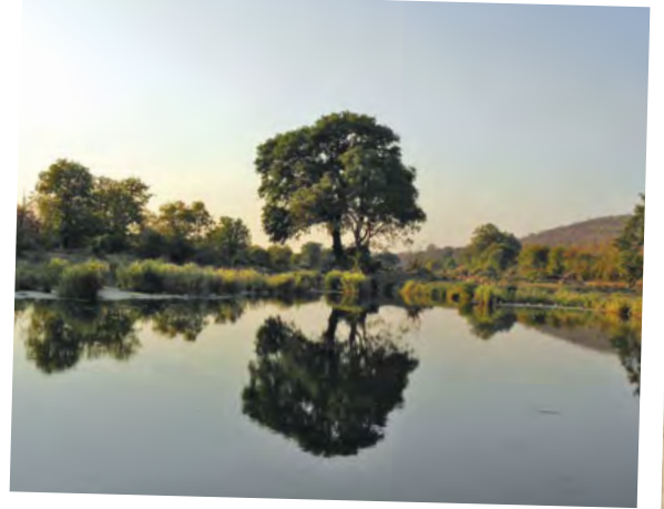
Tree and river

to respond to key threats to the environment in a coordinated manner, the Environmental Management Inspectors (EMIs) plan and implement joint compliance and enforcement operations that involve various spheres of government. In the last financial year, illegal sand mining, poaching in reptiles and the tanneries and taxidermist operations were highlighted for a number of joint operations.