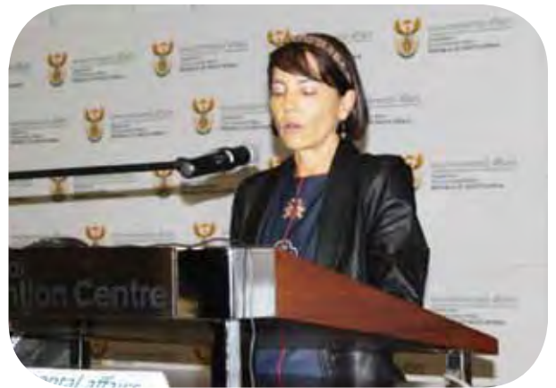
DEA Deputy Director-General for Climate Change and Air Quality, Ms Judy Beaumont addressing the media during a post-COP 19 media briefing.

The United Nations Framework Convention on Climate Change (UNFCCC) COP 19 concluded in Warsaw, Poland on 22 November 2013 on four major outcomes. The conference concluded keeping governments on a track towards a universal climate agreement in 2015 and including significant new decisions that will cut emissions from deforestation.