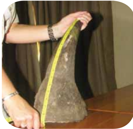
Measurements being taken of a rhino horn at the DNA Sampling Training workshops held at the Kruger National Park in Skukuza.