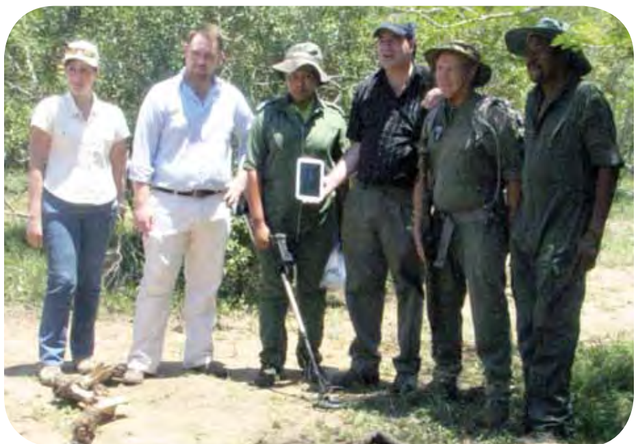
Workshop delegates and Kruger National Park field rangers by the rhino carcass crime scene the DNA Sampling Training workshops held at the Kruger National Park in Skukuza, South Africa from the 5- 6 November 2013.

He went on to note how law enforcers, do not follow a certain protocol when handling crime scenes, which when in court can be used by the defence to jeopardise the trial. Incidents like moving items around the crime scene or failure to use gloves in order to not contaminate DNA samples are such examples.