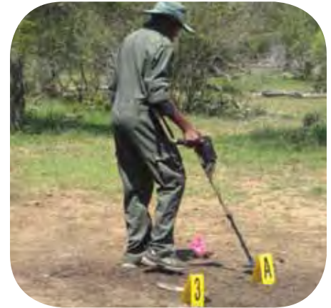
Kruger National Park, field ranger: Mr Oupa Manzini looking for bullets at the crime scene using the metal detector at the DNA Sampling Training workshops held at the Kruger National Park in Skukuza.

as all stockpile horns, to create a DNA database with the unique profiles of individual animals. RhODIS® was developed to assist in addressing the increase in rhino poaching, smuggling of rhinoceros horn and recovery/confiscation of horn and related products by consumer countries. These are analysed at Veterinary Genetics Laboratory (VGL) at the University of Pretoria's Faculty of Veterinary Science which currently has over 10 000 samples from black and white rhinoceros from Africa on its database.