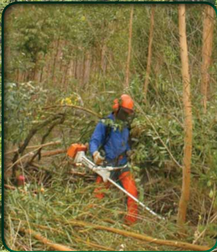
A Working for Water beneficiary clearing an alien invasive plant species, brushcutter. The wood will be used for manufacturing purposes in eco-factories.