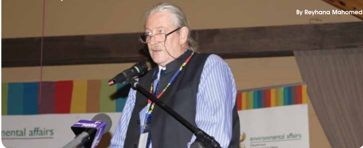
Department of Environmental Affairs, Deputy Director-General: Environmental Advisory Services, Mr Alf Wills delivering the keynote address on behalf of Minister Edna Molewa.

The Department of Environmental Affairs (DEA) released South Africa's Long-term Adaptation Scenarios (LTAS) Phase 1 reports at a climate change breakfast briefing for all stakeholders in Centurion, on 5 November 2013. The focus was not only on the release of the LTAS, but also the upcoming United Nations Framework Convention on Climate Change (UNFCCC) COP 19 which took place in Poland in November 2013.