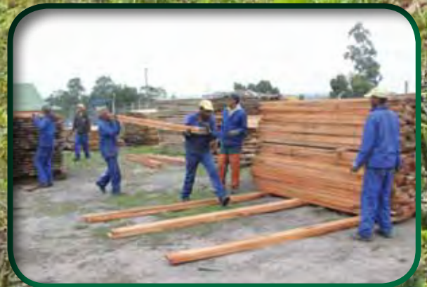
Milling operations at the Fairleigh eco-furniture factory.