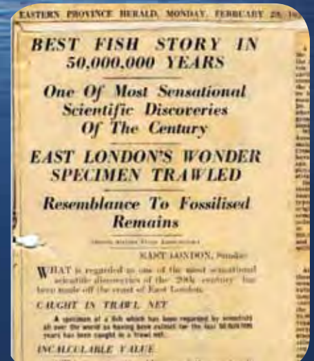
The coelacanth, thought to be extinct millions of years ago, was found in East London in 1938.

The African Coelacanth Ecosystem Programme (ACEP) is a flagship programme of SAIAB and is directly funded by the Department of Science and Technology (DST). The most important aspect of ACEP has been the collaborative research and platform provision provided by the DST; the Department of Environmental Affairs (DEA); Department of Agriculture, Forestry and Fisheries (DAFF); the Agulhas and Somali Currents Large Marine Ecosystem Programme (ASCLME); the South African Environmental Observation Network (SAEON); National Research Foundation (NRF) and SAIAB, which