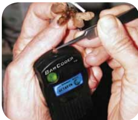
A handheld barcoder, as shown here, has many uses. Promoting technology developments of portable devices for field use is a major initiative.

The short-term goals are to employ the use of DNA barcode evidence