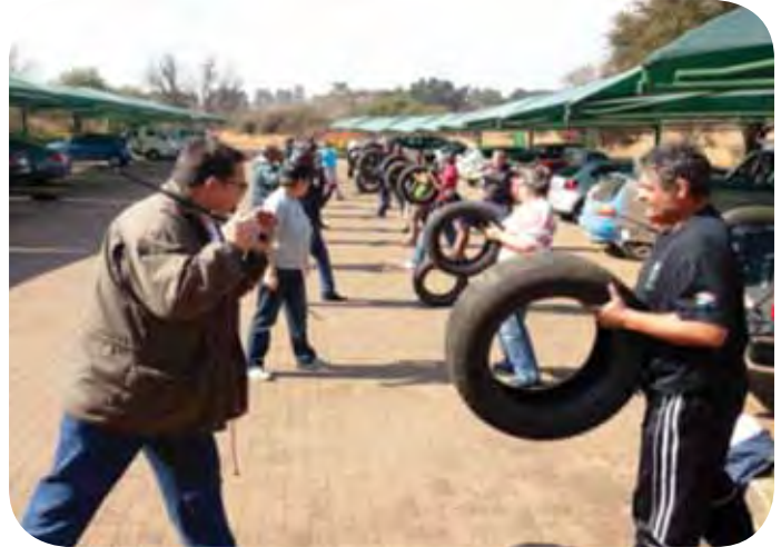
Skills capacity development through interaction with other environmental management inspectors.