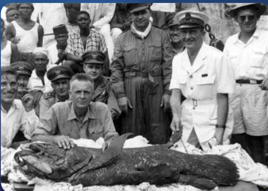
Professor JLB Smith caught the second coelacanth in the Comores in 1952.

http://animals.nationalgeographic.com/animals/fish/coelacanth/