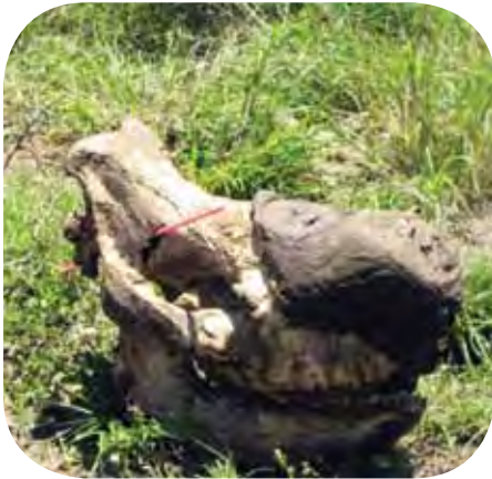
The skull of the poached rhino with a marker placed where the bullet went through the skull at the DNA Sampling Training workshops held at the Kruger National Park in Skukuza.