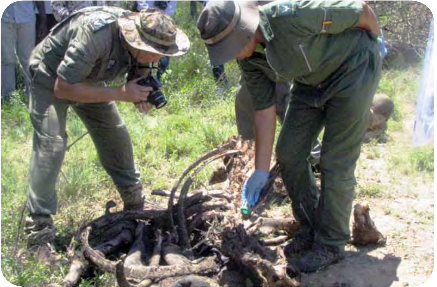
The Kruger National Park team sampling DNA of the dead carcass of the poached rhino at the DNA Sampling Training workshops held at the Kruger National Park in Skukuza.

In an effort to clamp down on illegal rhino horn trade, law enforcement officers from eleven African rhino range states as well as those from the key Asian countries, participated in the first international rhinoceros DNA sampling workshops. The workshops which were generously sponsored by the Netherlands, were held at the Southern African Wildlife College near Hoedspruit, on the 5-6 November 2013.