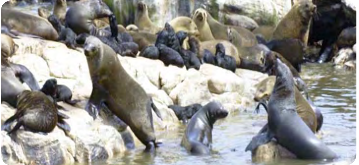
Artificial breeding platforms designed for flying birds.

After centuries of Cape fur seal harvesting that left the species on the brink of extinction, the Department of Environmental Affairs (DEA) placed a moratorium on the harvesting of seals and undertook various conservation efforts that resulted in a mushrooming of the population. The burgeoning population is now being mitigated by the establishment of artificial nesting sites.