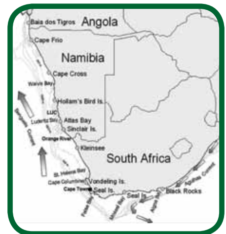
Range of Cape fur seals ©Kirkman Steven.

South Africa is home to a variety of species of seabirds that are exclusive to the southern African region. Unfortunately, their population numbers have been diminishing. The International Union for Conservation of Nature, the body that determines how well any animal or plant species is performing, has classified some seabirds in South Africa as endangered or threatened. At certain localities known for large concentrations of penguins, few or no birds remain. Lessons learned at Vondeling Island will be very useful in averting possible future adverse interactions.