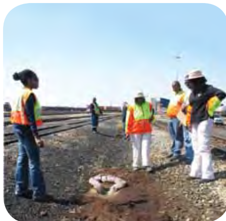
Gauteng's Environmental Management Inspectors carrying out their duties on site.

The NECER is accordingly divided into various sections, including information on the compliance and enforcement capacity; the enforcement (criminal, administrative, civil) and compliance monitoring activities (proactive, reactive inspections) being undertaken by various authorities; the most prevalent types of environmental crimes being reported and responded to; the legislation and court cases relating to environmental matters; as well as the capacity-building interventions and engagement with key stakeholders in the sector.