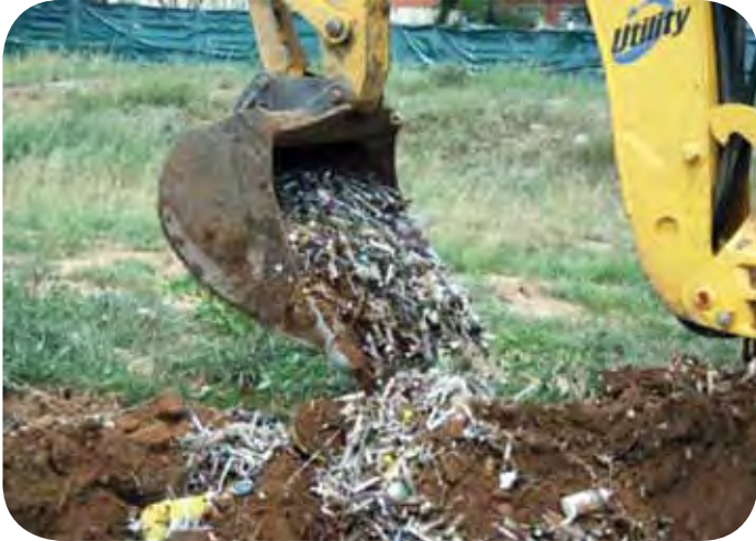
Illegally disposed medical waste.