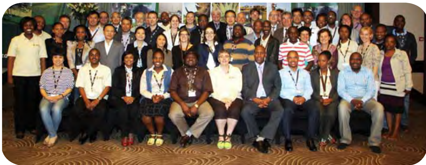
Delegates at the International Committee on Contaminated Land.

It has been revealed by the Department of Environmental Affairs (DEA) that an African Forum on issues pertaining to contaminated land will be established. This was during the 11th International Committee on Contaminated Land hosted in Durban, on 9 – 11 October 2013.