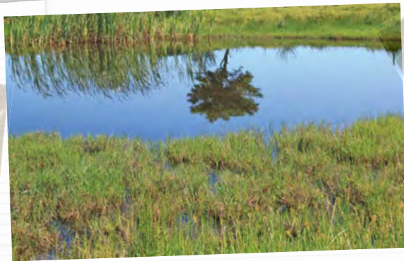
Veld & wetlands - East London