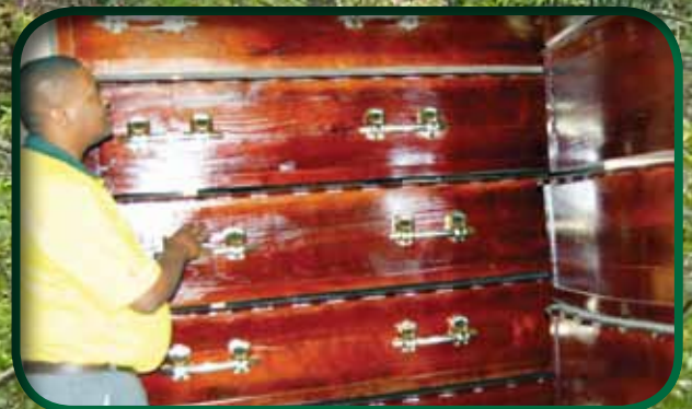
The eco-coffins produced by the Eco-Furniture Factories Programme.

of the Departments of Health and of Basic Education. Each factory is expected to create approximately 160 jobs when fully operational. The Programme seeks to benefit the marginalised in terms of race, gender, disability and age and these will inform the uptake of programme beneficiaries.