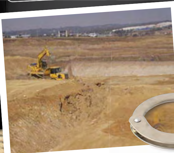
Illegal sand mining

There has been a 25% (214) increase in the number of Grade 5 EMI field rangers from 841 in 2011/12 to 1 055 in 2012/13.