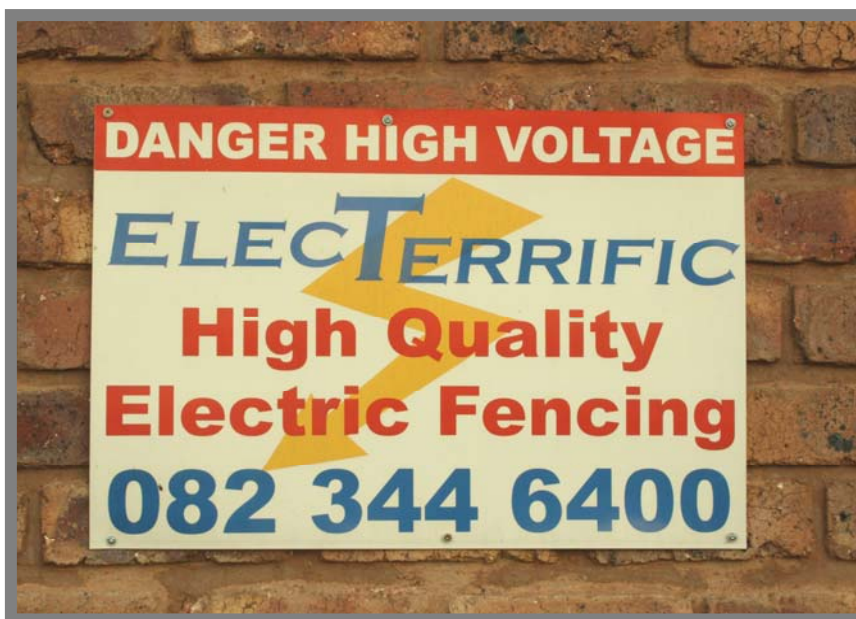
Signs indicating alarm systems, reaction units and electric fences