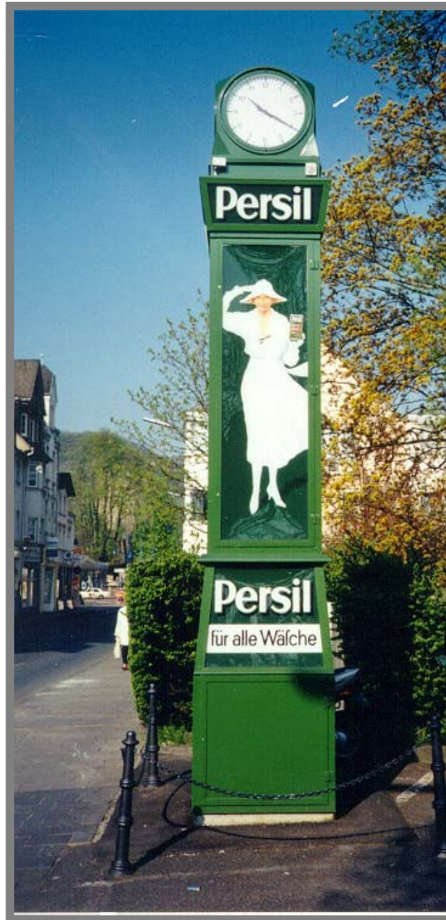
An advertising structure with a historical appearance