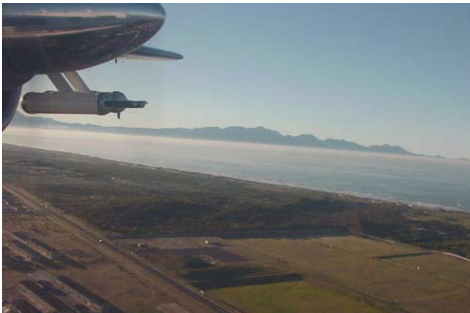
Pollutant concentrations in Cape Town, contributing to the Brown Haze, are measured using instruments fitted to an aeroplane.

The study up to the year 2004 concluded that existing data coverage was insufficient to identify all potential priority areas accurately, or to quantify the effects of air pollution on human health and the environment.