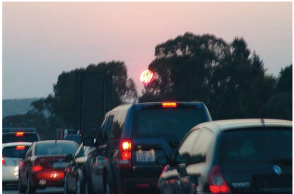
Evening peak-hour traffic contributes to overnight pollution levels in Johannesburg as commuters drive along the highway.