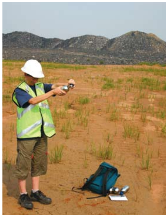
Field measurements taken during research projects provide valuable insight into the state of air.

Considerable work and monitoring of air quality is done in South Africa through various scientific research programmes. Specific studies are normally planned to address identified research questions or hypotheses, with the purpose of adding information and contributing to a better understanding of South African air quality problems. Among the contributing research initiatives described in this report are: Cape Town Brown Haze Studies; the Southern Africa Regional Science Initiative (SAFARI 2000); regional-scale aircraft monitoring programmes; ozone modelling as part of the Cross Border Air Pollution Impact Assessment (CAPIA) project; acid deposition monitoring; biogenic volatile organic compound emission estimation; and regional-scale passive monitoring.