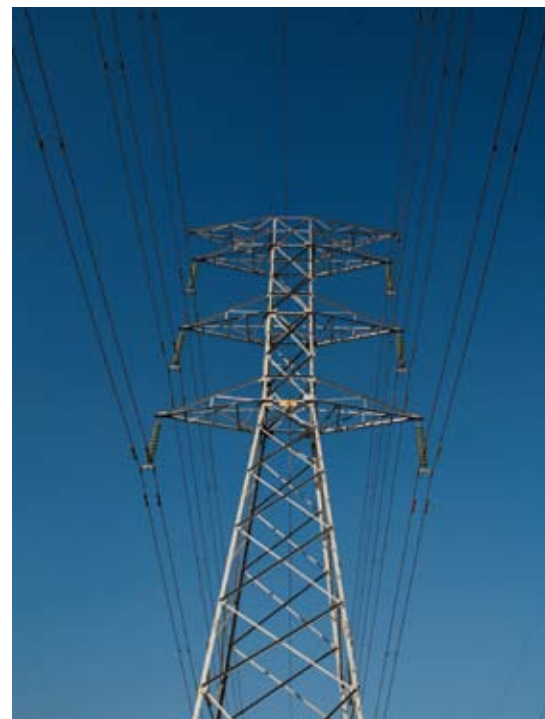
An electricity transmission line.

Significant non-combustion-related anthropogenic sources included industrial process emissions; waste disposal; dust from vehicles driving over paved and unpaved roads (vehicle-entrained dust); wind-blown dust from open areas (including mine dumps and open-cast mining); and agricultural activities. Furthermore, regionally-transported, aged aerosols contributed significantly to background air-pollutant concentrations, particularly over the interior.