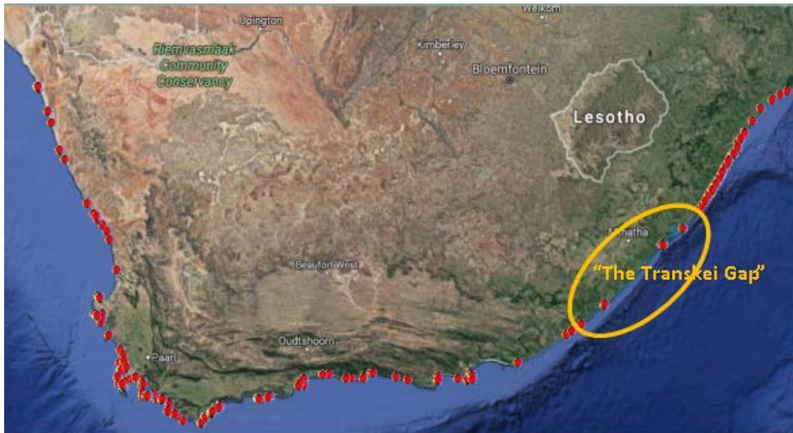
Map of SA Coastline illustrating Department of Public Works State Coastal Properties

2.4 The Coastal Infrastructure Development (CID) initiative seeks to support the "Tourism" aspect of point 5 of the country's 9-Point-Plan, point 5 being Operation Phakisa (Oceans Economy, Mining, Health, Tourism, Basic Education etc.).